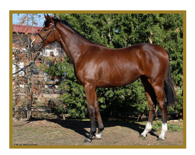
2019 DINK FILLY