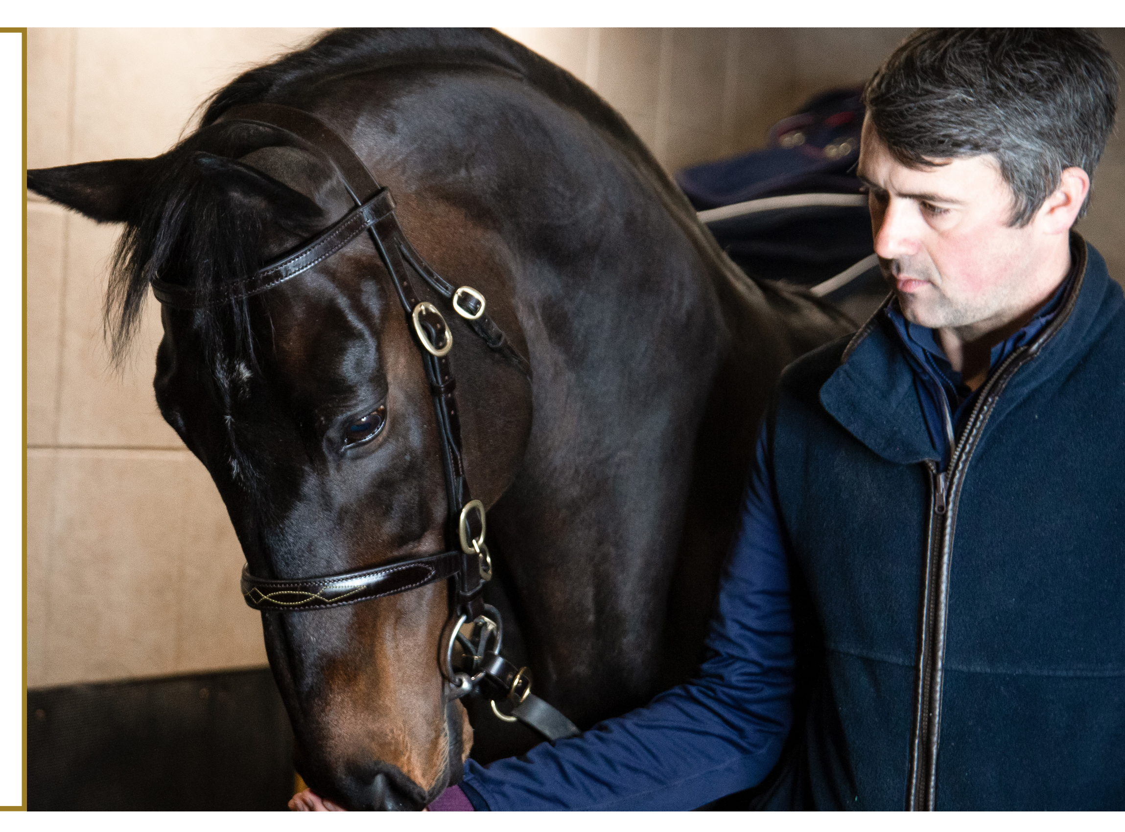
"I have been impressed by Dink's offspring, he produces good models who have excellent movement"

Welcome to Alne Park Stud, the home of Dink, the only breeding son of champion sire Poliglote and sire to the 2020 Desert Orchid Chase winner, Nube Negra.