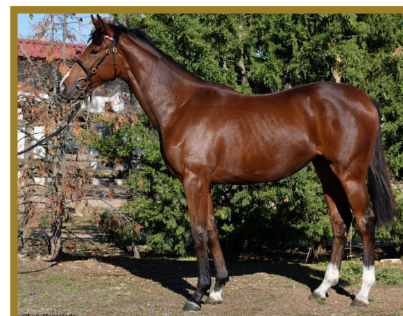
2019 DINK FILLY