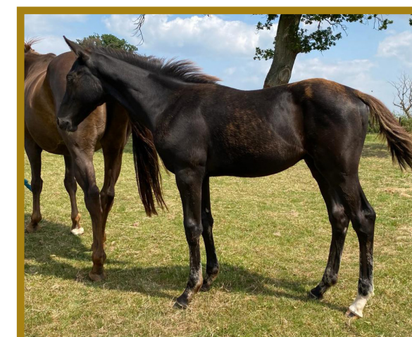
2021 DINK COLT

“I have been impressed by Dink’s offspring, he produces good models who have excellent movement”